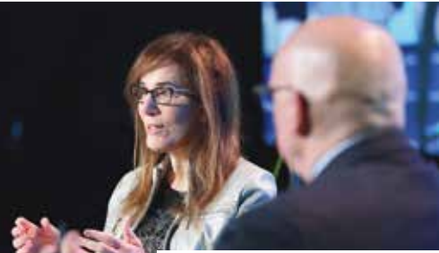
Epic Founder and Chief Executive Officer Judy Faulkner, MCS , shared her thoughts on the future of digital healthcare.