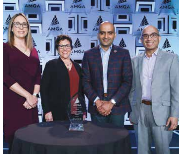
Distinguished Sponsor Award: Amgen received the 2023 Distinguished Sponsor Award.