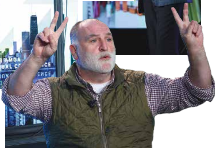
Chef José Andrés , restaurateur, humanitarian, and founder of World Central Kitchen, empowered healthcare leaders to be active partners in building a healthier nation by focusing on nutrition as a means to reduce chronic illnesses.