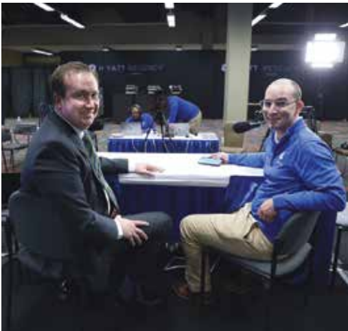
Leaders from AMGA member groups convened in Chicago for educational sessions, networking, and poster sessions.