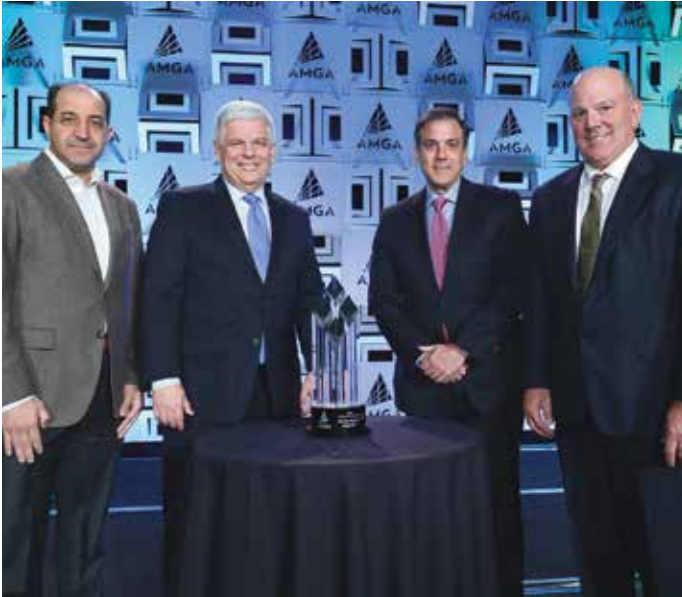
Acclaim Award: Premier Medical Associates received the first Acclaim Award in three years. Read more about this achievement on page 10.