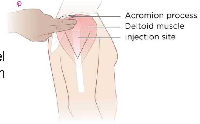
FIGURE 1. Intramuscular needle insertion